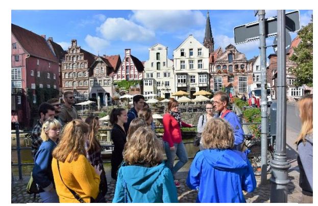
The students get a guided tour of Lüneburg