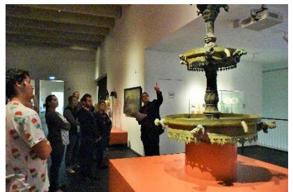
In the Lüneburg Museum

Cultures visited an integration course for immigrants and refugees at the local